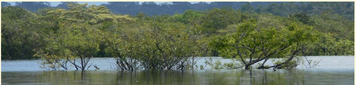
Inundated flood planes in FSC certified area

Download the statement at www.fsc.org/fileadmin/web-data/public/document_center/News/Statements/2008-08-21_FSC_statement_-_Forests_and_climate_change.pdf .