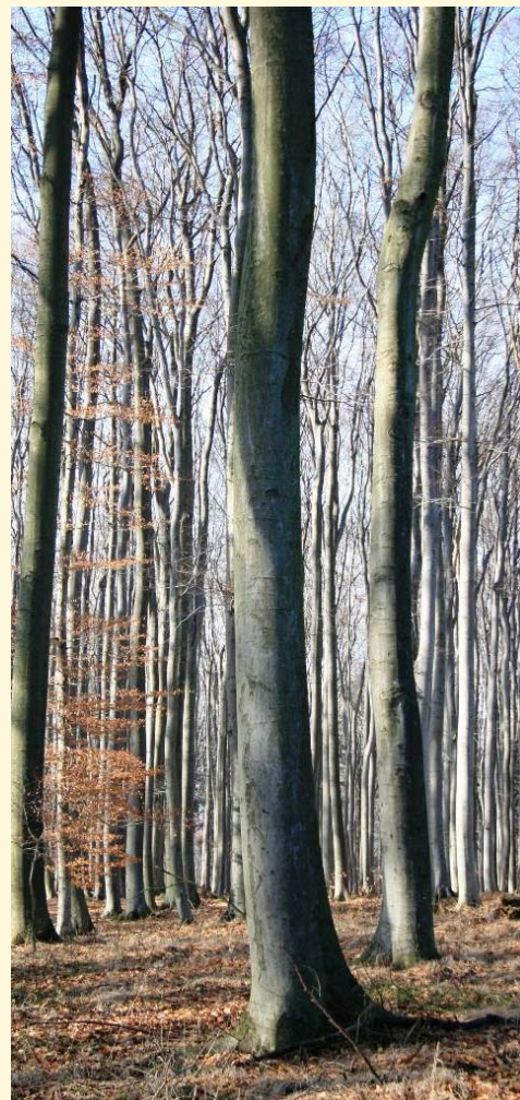
FSC certified forest, Czech Republic

The final draft of the revised P&C is expected to be submitted to a vote by the FSC membership by the end of 2009.