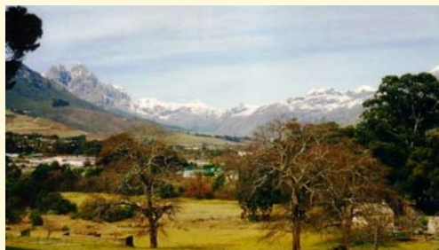
Experience the beauty of nature near Stellenbosch. Join the trip to Jonkershoek Nature Reserve.

The natural vegetation of Jonkershoek Nature Reserve is mainly mountain fynbos. Over a thousand plant species, including the distinctive proteas, or sugar-bushes, are found within the reserve. Several relic forest communities occur in narrow, moist kloofs characterize the landscape and dense riparian vegetation grows along the banks of the Eerste River.