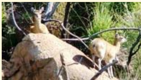
Klipspringers basking in the sun. Numerous wild animals and 1100 plant species live in the reserve.

Within the General Assembly 2008, FSC has organized a field trip to one of the most beautiful nature reserves near Cape Town – the Jonkershoek Nature Reserve. This excursion will give participants the opportunity to explore an extraordinary ecosystem of regional flora and fauna, and witness the beauty of the imposing Jonkershoek Mountains.